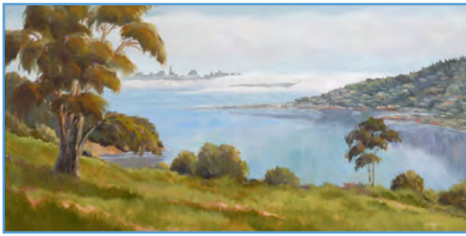
PAINTING BY ZEE ZEE MOTT