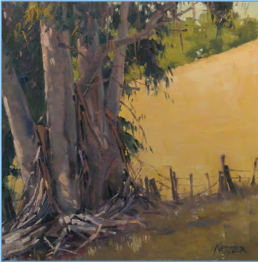
PAINTING BY PAUL KRATTER