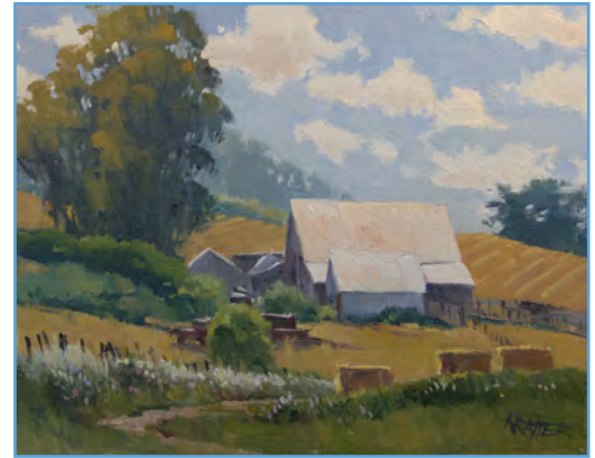
PAINTING BY PAUL KRATTER

fill the need for Marin to develop Zero Waste solutions and incorporate Zero Waste into Marin's five year Integrated Waste Management Plan.