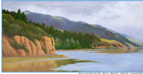
PAINTING BY ZEE ZEE MOTT