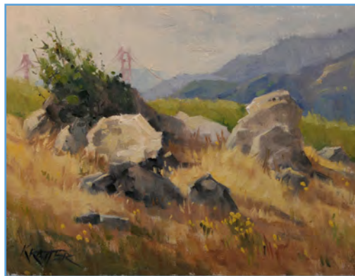
PAINTING BY PAUL KRATTER